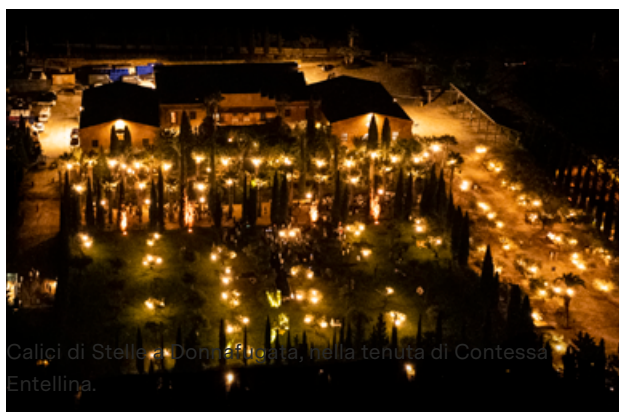
Calici di Stelle a Donnafugata, nella tenuta di Contessa Entellina.

Since 2012, the Donnafugata's vineyards and estates have become the location for an immersive experience where night-time scents are combined with the emotions of startling and specially designed artistic performances . From music , to dance , to the puppet opera , there are countless artists hosted on the stage who have presented works dedicated to the relationship between man and nature and the magical combination of wine and art.