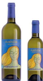
Anthilia Sicilia Doc Lucido in blend with other grapes