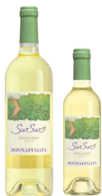
SurSur Sicilia Doc Grillo