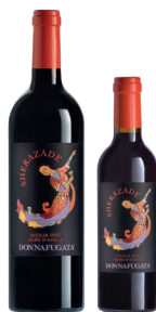
Sherazade Sicilia Doc Nero d'Avola