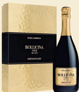
Bollicina Gold Brut Rosé with box Sicilia Doc Metodo Classico Nerello Mascalese