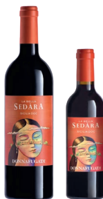
Sedara Sicilia Doc Nero d'Avola in blend with other grapes