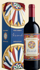
Tancredi Terre Siciliane Igt Cabernet Sauvignon, Nero d'Avola, Tannat