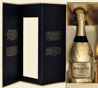
Bollicina Gold Brut Rosé Kit with bottle cover Sicilia Doc Metodo Classico Nerello Mascalese