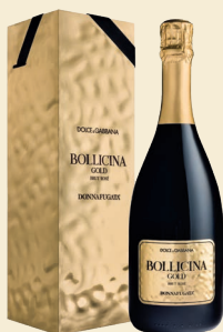
Bollicina Gold Brut Rosé Sicilia Doc Metodo Classico Nerello Mascalese

Bollicina Gold Brut Rosé , a traditional method sparkling wine, represents the crowning achievement of this collaboration and embodies the perfect synthesis of stylistic creativity and craftsmanship in production .