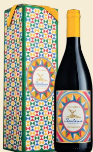
Isolano Etna Bianco Doc Carricante