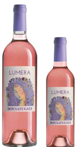
Lumera Sicilia Doc Nero d'Avola, Syrah, Nocera