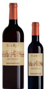
Ben Ryé Passito di Pantelleria Doc Zibibbo