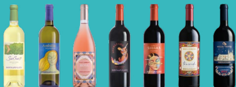
Contessa Entellina Estate