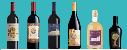
Contessa Entellina Estate