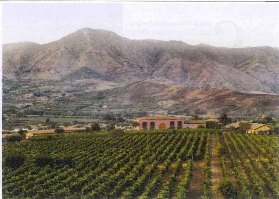
Leading Etna producer Tenuta delle Terre Nere, owned by American importer Marc de Grazia, has contributed to the growing excitement over Sicilian wine with its traditionally styled bottlings from 50- to 100-year-old bush-trained vines.

The mountain's vineyards fan out from north to southwest, but lie primarily on the eastern side of the mountain. Harvest is typically in mid- to late October, though for some producers, it extends into