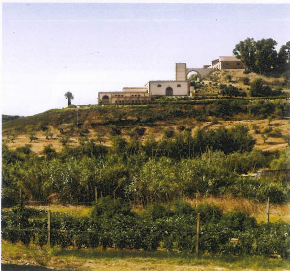
Feudi del Pisciotto was carved from a tract of land adjacent to the Sughereta di Niscemi cork tree forest, near the southern coast.