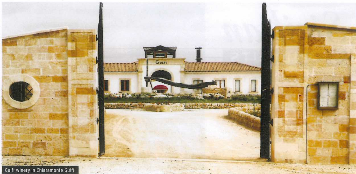
Gulfi winery in Chiaramonte Gulfi

bought vineyards in the Santo Spirito contrada near the town of Passopisciaro. This fall the winery will release its first white Carricante and red Nerello Mascalese.