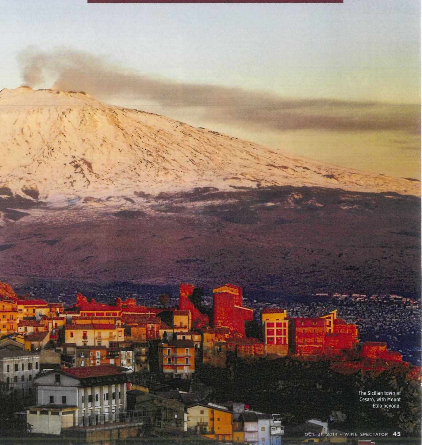
The Sicilian town of Cesarò, with Mount Etna beyond.