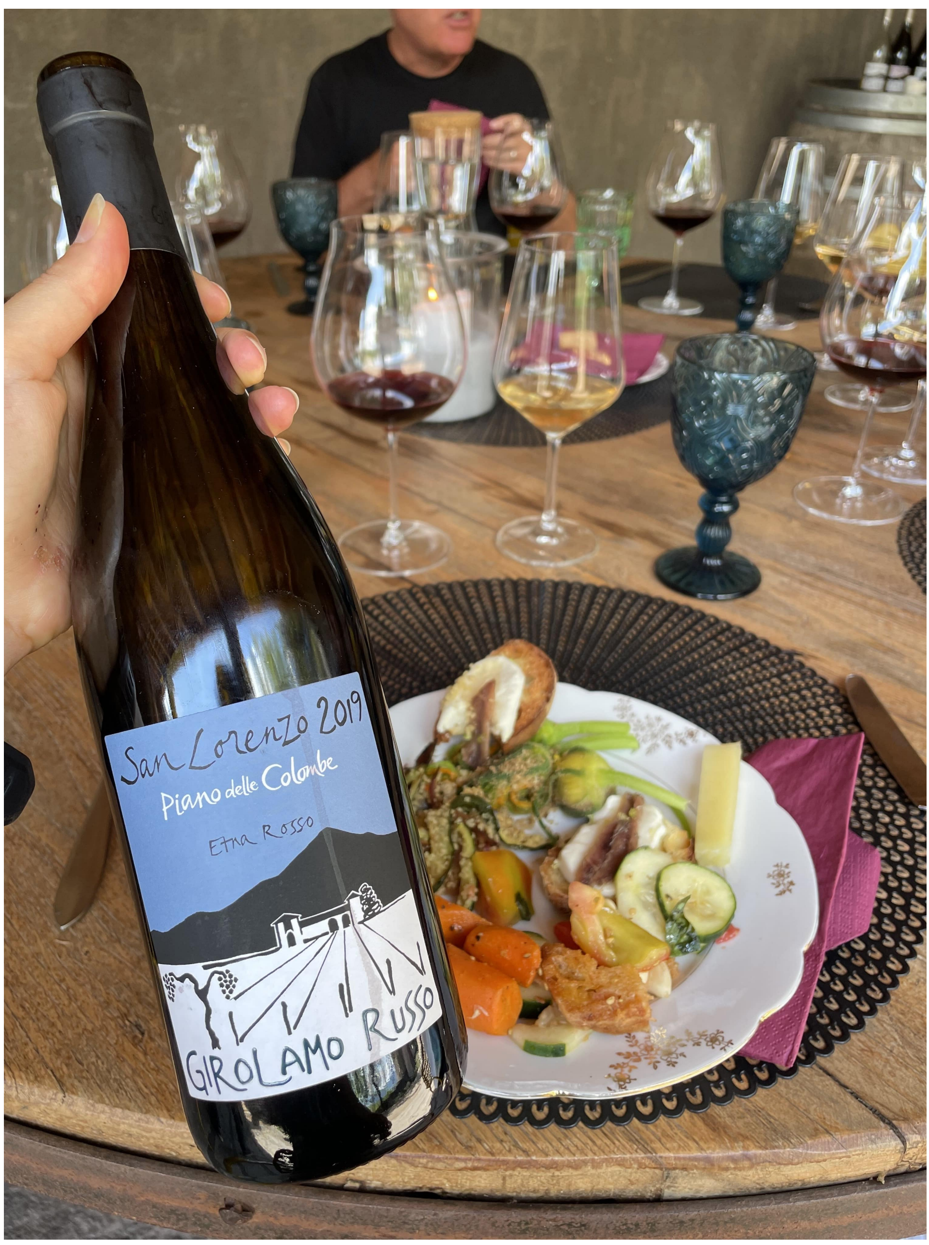
The Girolamo Russo Piano delle Colombe 2019 has the perfumed, floral character alongside ripe red berry fruit notes characteristic of Girolamo Russo's wines.