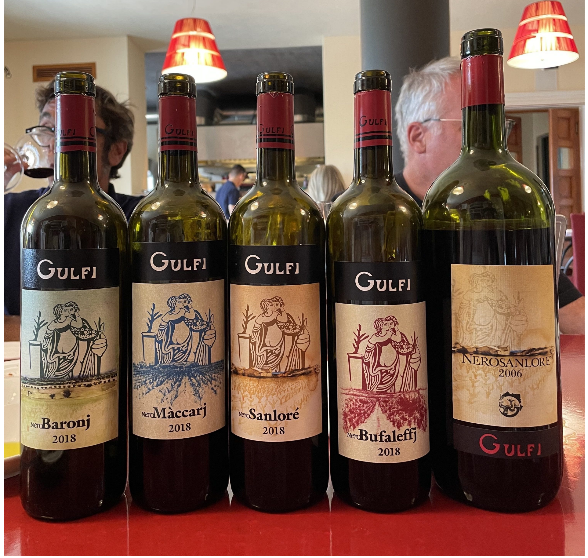
Gulfi's range of single-vineyard nero d'avolas.

Other producers are experimenting with single-vineyard wines. For example, we tasted a small production of a 2017 single-vineyard nero d'avola from Feudo Maccari, located in the south between Noto and Pachino. These may prove to be the basis for a whole new concept similar to Etna's and Barolo's single-vineyard wines.