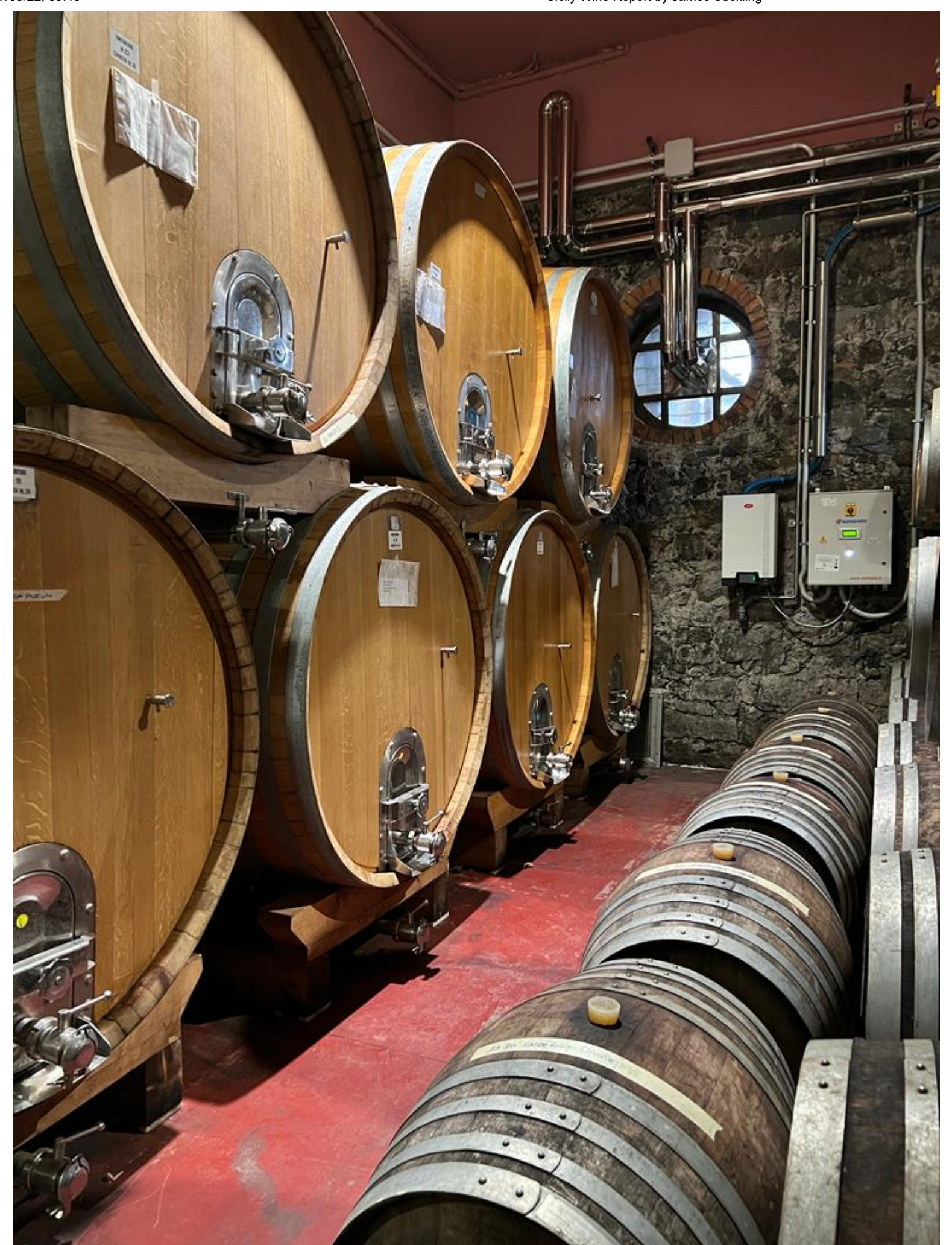
The cellar at Girolamo Russo.

Further south, nerello mascalese is harvested up to one month earlier, like those on the red, iron-rich sandy soils of Contrada Monte Serra on the southeastern slope. We retasted the Benanti Etna Rosso Contrada Monte Serra 2019, the highest-scoring among a five-vintage vertical from 2016 to 2020. It showed plenty of structure alongside ripe fruit, cedar and mineral ash notes.