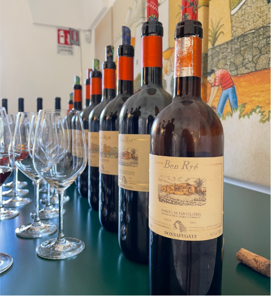
Left: The vineyards of Donafugata in Pantelleria, an island off the southwest coast of Sicily. Here, the vines are grown in little basins to protect from strong winds, with wind breaks in the vineyards | Right: The lineup of Donnafugata wines from Pantelleria we tasted included Mille e Una Notte reds and Ben Rye passitos.

We tasted various verticals and we could see how the wines have changed from slightly overdone, even rustic reds and whites to much more refined, terroir-specific wines. But when it came to our vertical of Donnafugata's Ben Rye Passito di Pantelleria back to 2002, tasted on-site on our visit to the island of Pantelleria itself, which is off the southwest coast of Sicily, the consistency and complexity in the wines were a delight.