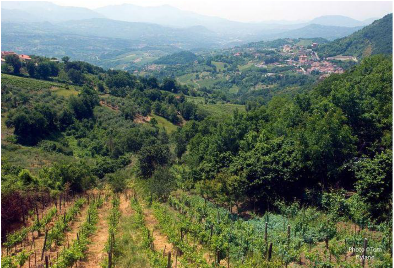
Vineyard at Montefusco, in the Greco di Tufo zone

I write about wine (and sometimes food) from around the world.