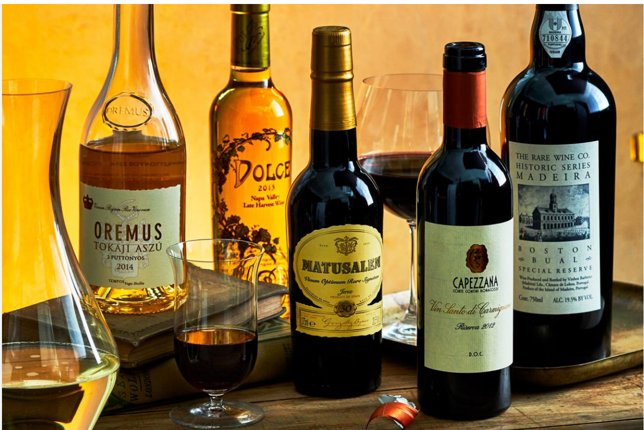
FOOD STYLING BY MARGARET DICKEY / PROP STYLING BY KATHLEEN VARNER

For me, though, any great sweet wine—particularly sipped in solitude, in front of a roaring fire on a winter night—qualifies as a vino da meditazione. Maybe some music, maybe just the crackle of burning logs; possibly the snow falling silently outside; no company but your own thoughts and the fluid, shifting taste of the wine.