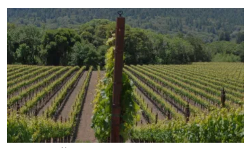
A Family Affair