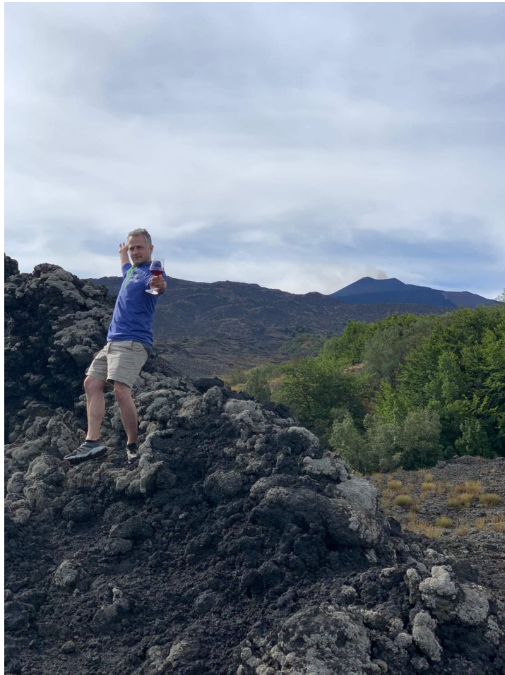
The author, surfin' sciare on Mt. Etna

both high-payoff and labor-intensive. And, as you've probably experienced if you've been to a restaurant in a major city before (or even during) lockdown, Etna is capable of producing wines that get hipster sommeliers worked into an almost orgasmic frenzy.