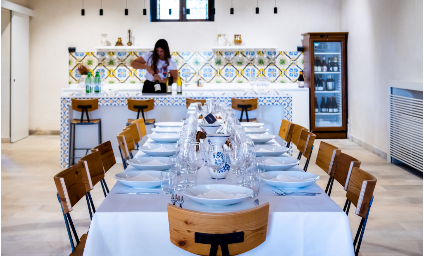
https://the chosentable.com/2022/11/01/a-taste-of-cerasuolo-di-vittoria-the-only-docg-wine-of-sicily/?fbclid=IwAR0xMEVOCzbdOjfnrJZrWXr8Om\ldots 14/26