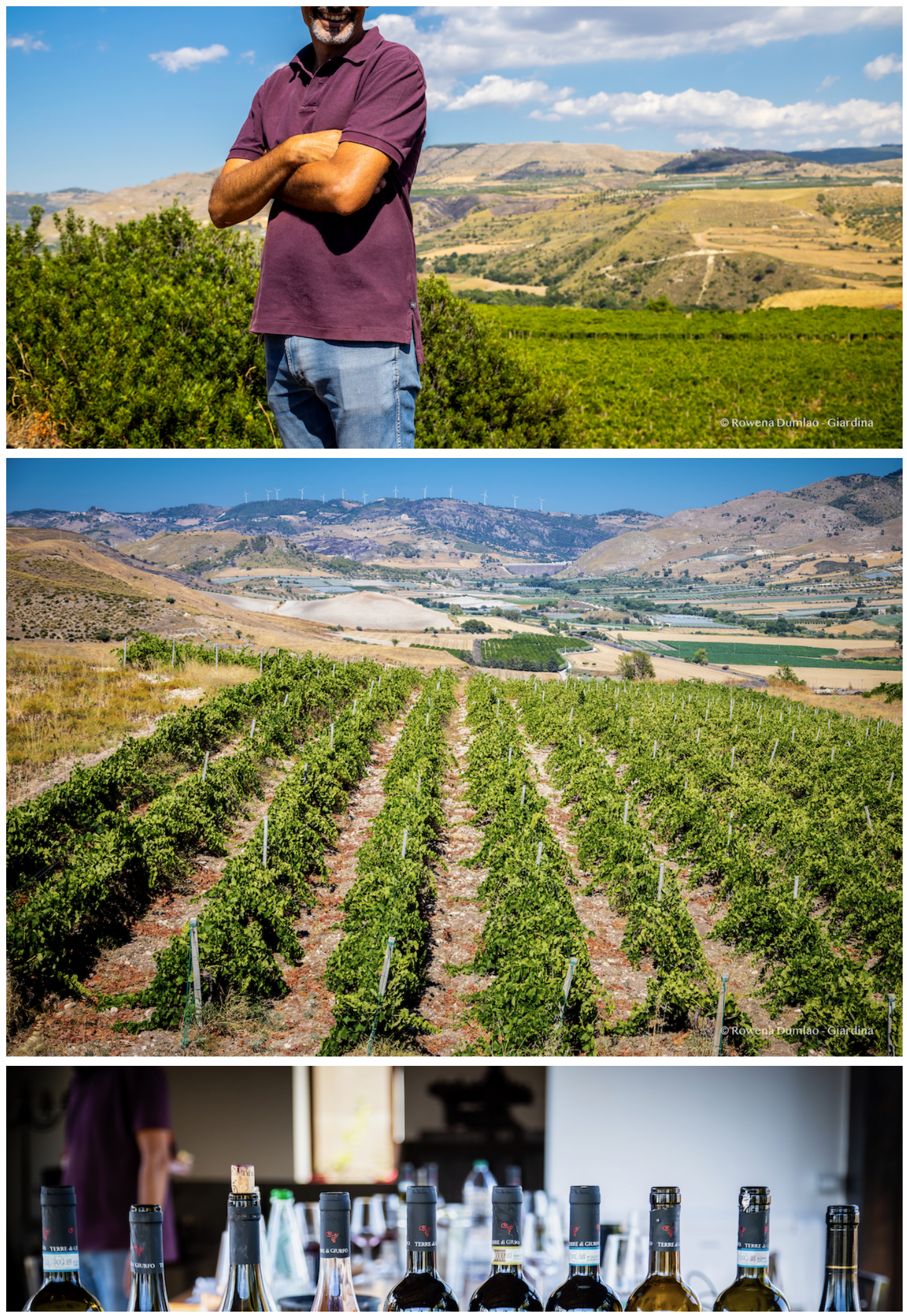
https://the chosentable.com/2022/11/01/a-taste-of-cerasuolo-di-vittoria-the-only-docg-wine-of-sicily/?fbclid=IwAR0xMEVOCzbdOjfnrJZrWXr8Om9\dots 9/26