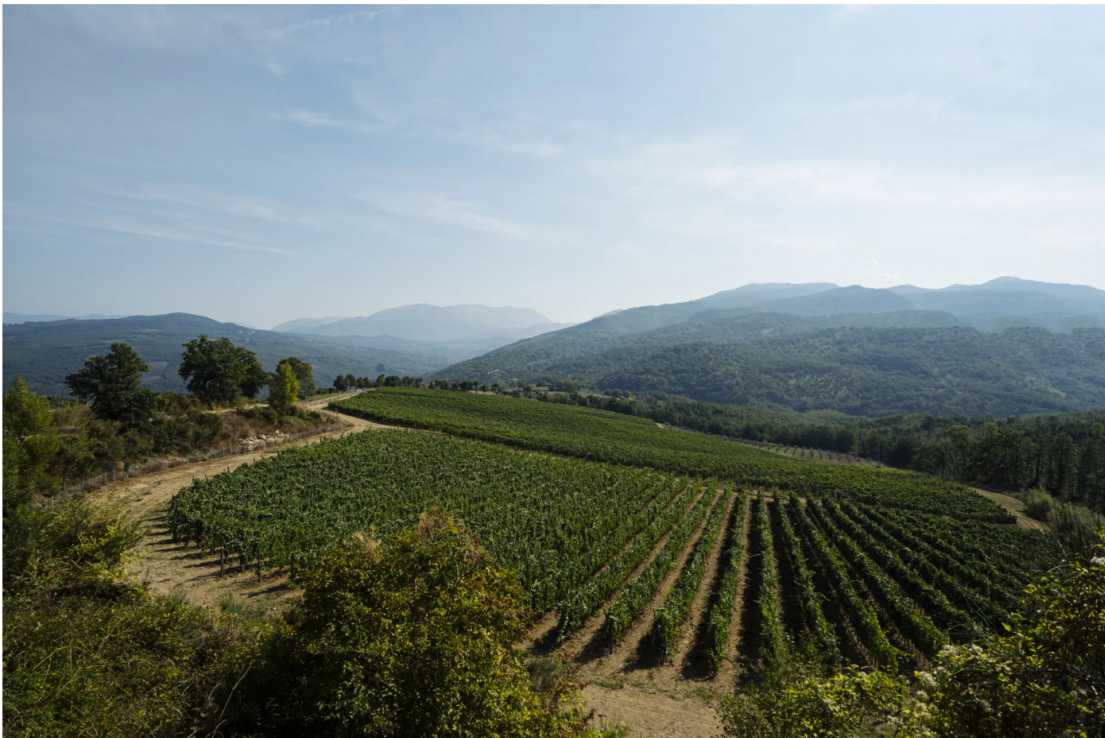
Vineyards at SanSalvatore1988

A microcosm at the gates of Paestum. Here is more than just wine. SanSalvatore1988 is the representation of a healthy and enjoyable lifestyle. Biodynamic hillside vineyards next to a buffalo farm overlooking Capri which also produces the energy needed by the cellar. Here the mantra is "many little differences make a difference". Like 'La Dispensa di San Salvatore' its mozzarella, yoghurt and fruit extracts. WEBSITE