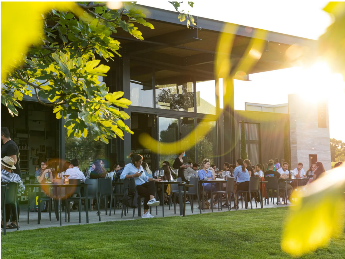
Aperitivo at Enio Ottaviani winery

On the hills behind Riccione, where you can go in search of an evening breeze after a day spent in the sun, you will find a contemporary wine cellar, designed in metal and glass, facing the vineyards. At aperitif this location becomes the ideal meeting place, with a sparkling atmosphere, traditional cuisine and a list of wines from Romagna that are as fun as they are surprising. WEBSITE