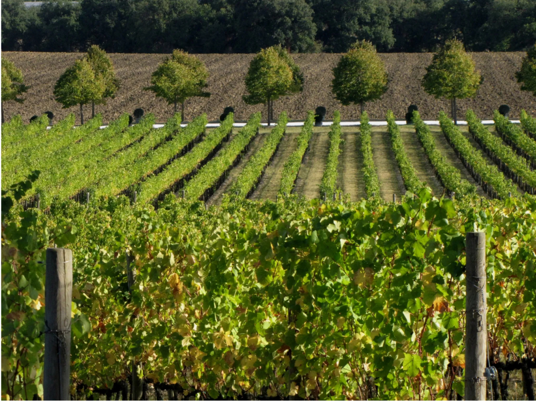
Il Pollenza Vineyards