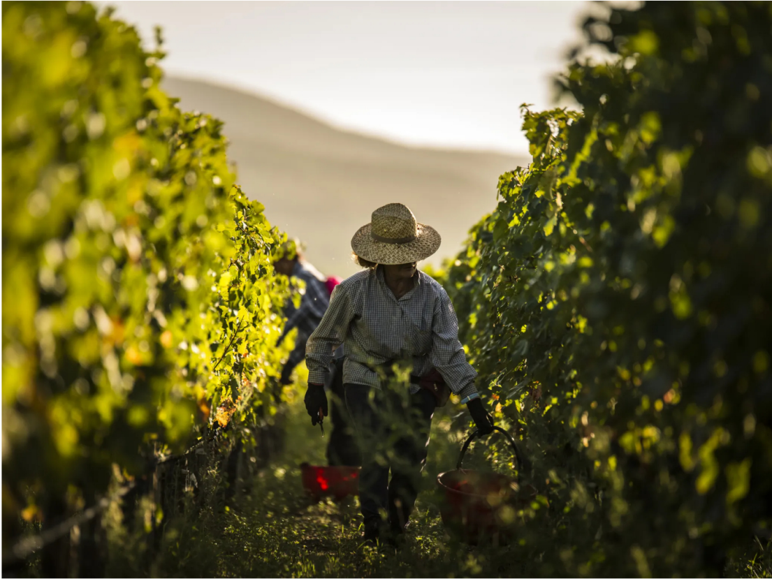
Collecting grapes at Cantina del Bruciato

A modular shell, built with perforated panels that act as heat dissipating elements and shielding from sunlight, is set among Mediterranean scrub dunes to create a harmonious contrast. Undoubtedly a futuristic project which even called into question the Vitruvian principles for its conception. If that weren't enough, you can always add a tasting of what are considered the iconic wines of Bolgheri as well as a trip to the gourmet restaurant. WEBSITE